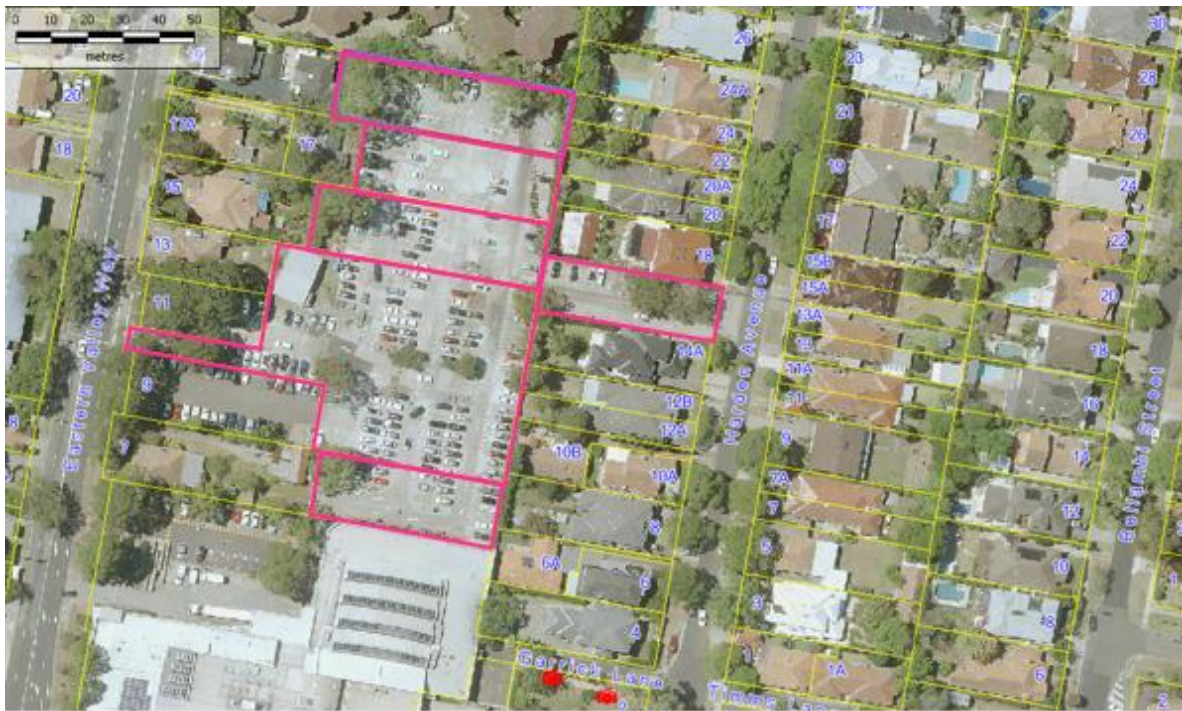
Map 2: Aerial photo subject site bound red