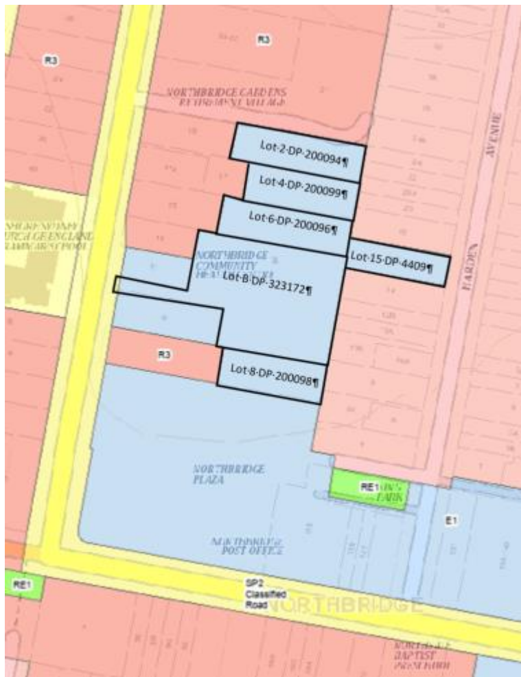
Map 3: Zoning of subject site and surrounds