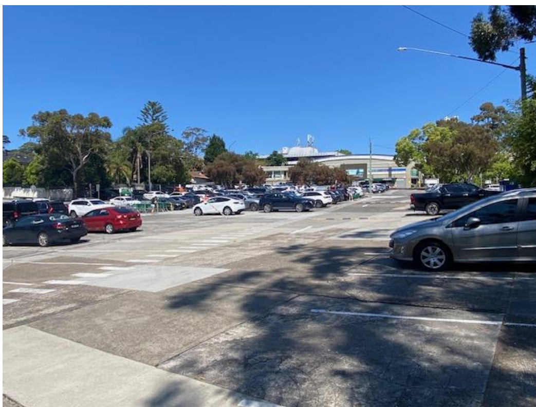
Photo 2: Carpark looking south towards Northbridge Plaza shopping centre